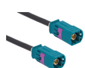
HSD to HSD