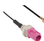
FAKRA to AMC