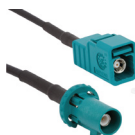
FAKRA to FAKRA