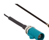
FAKRA to AMC4